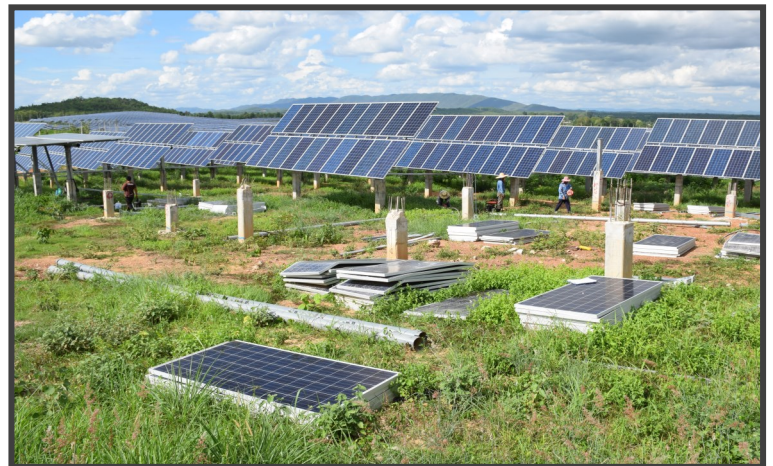
Solar Park, Thailand