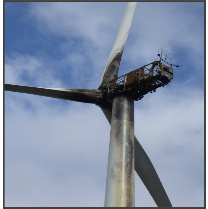
Wind Turbine Failure, U.K.

We provide Engineering Consulting Services and Support to the Insurance and Legal Industries on matters relating to all types of power generation, construction, heavy industry and maintenance facilities, and act as Expert Witness in Arbitrations and Legal Proceedings.