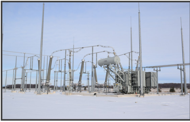
Wind Farm HV Substation, Canada