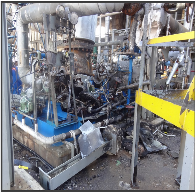
Turbine Failure, Trinidad