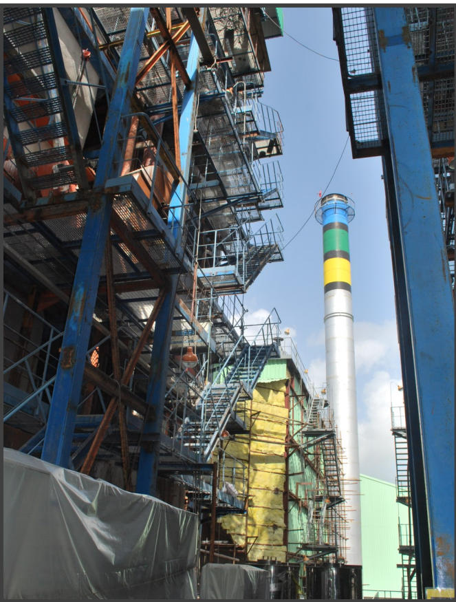
Construction of Gas Cleaning Equipment, C.A.