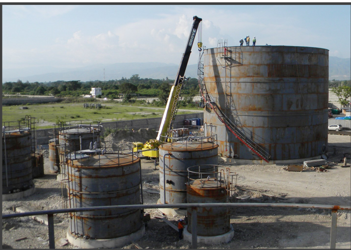
Construction of Tank Farm, Haiti